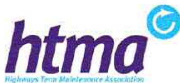
Highways Term Maintenance Association