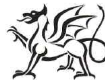
Llywodraeth Cynulliad Cymru Welsh Assembly Government Welsh Assembly Government